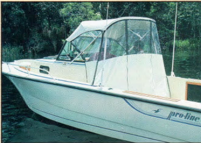
The 23 Walkaround with aft and side curtains.

In keeping with Pro-Line's policy of continuous improvements on all products, we reserve the right to change specifications without notice. Some items displayed on boats are optional equipment, and not all items shown are available on all boats. Contact your dealer for complete warranty information.