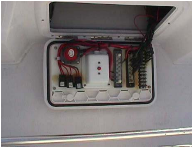
Fig 2 helm panel