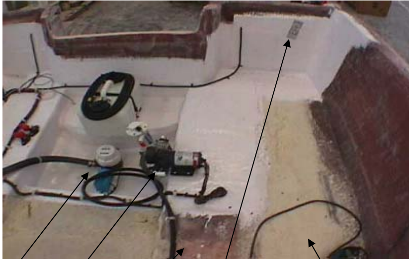
Bilge pump, washdown pump, port stringer, backing plate for pad eye, flotation foam

Water separator / filter units are located in the bilge. The spin on cartridges should be changed at least seasonally, more often depending on use and conditions. Pro Line boats equipped with oil injected outboard engines have onboard oil tanks. Ensure that the tanks are well stocked with the recommended 2 stroke oil - refer to your engine manual. It is imperative that the oil supply remain clean and uncontaminated by water or dirt, check to make sure that the oil lines are free from leaks, kinks, and chafing.