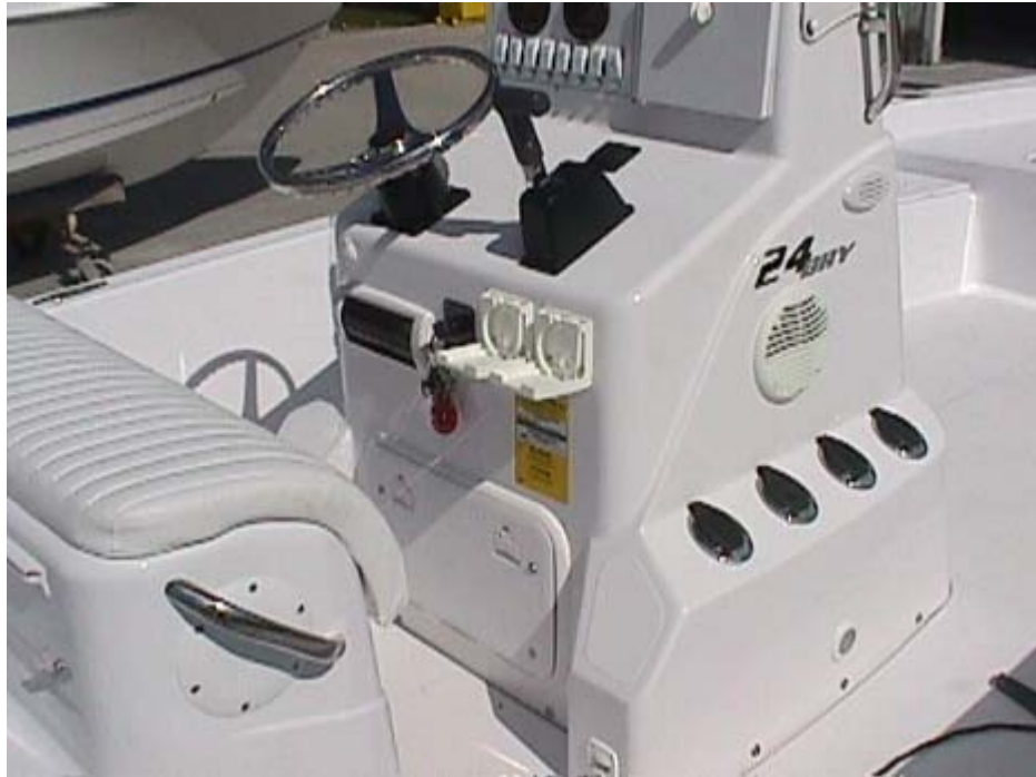
Fig 1 helm